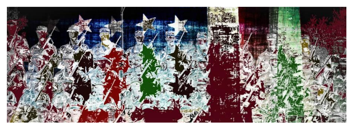
Composite Photograph with Digital Painting (2012), Courtesy Tif Holmes