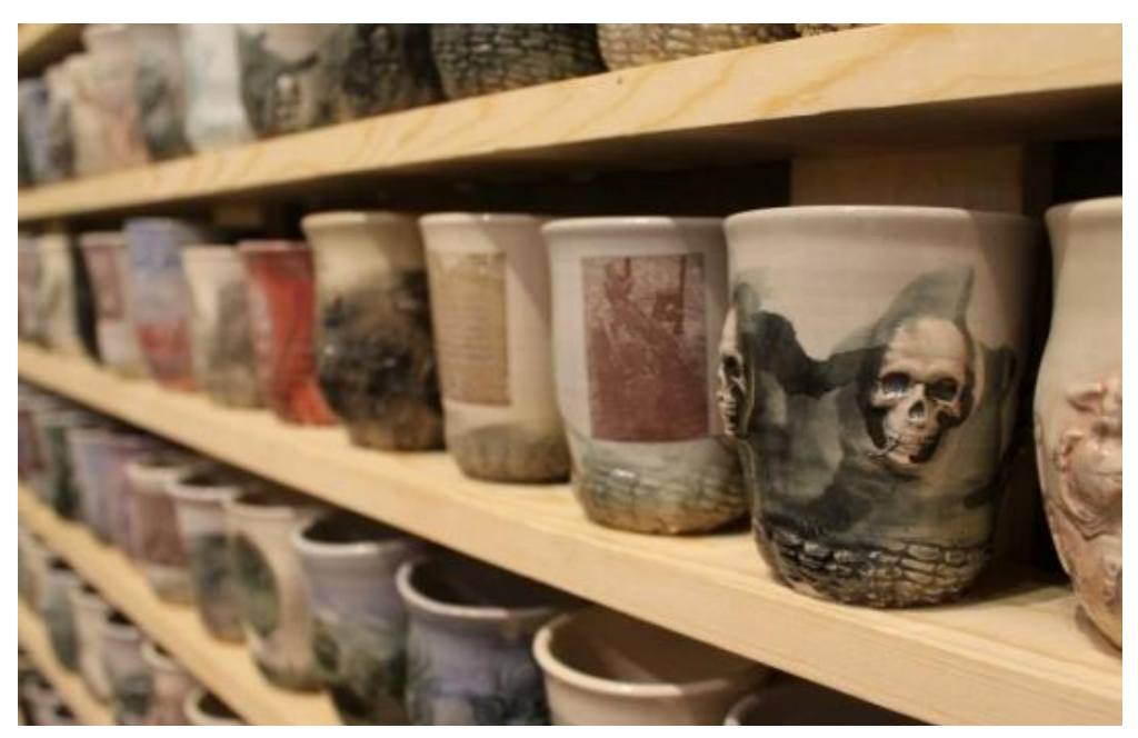
Stoneware Cups (2012), 48 X 25 X 5 in., 11 rows of 209 cups, Photo Courtesy G. Pellicano